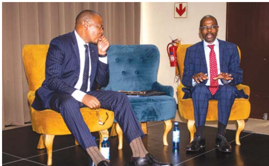
Monetary Policy Committee members

"The Monetary Policy Committee (MPC) of the Central Bank of Lesotho (CBL) held its 112th meeting on 25th March 2025. The Committee