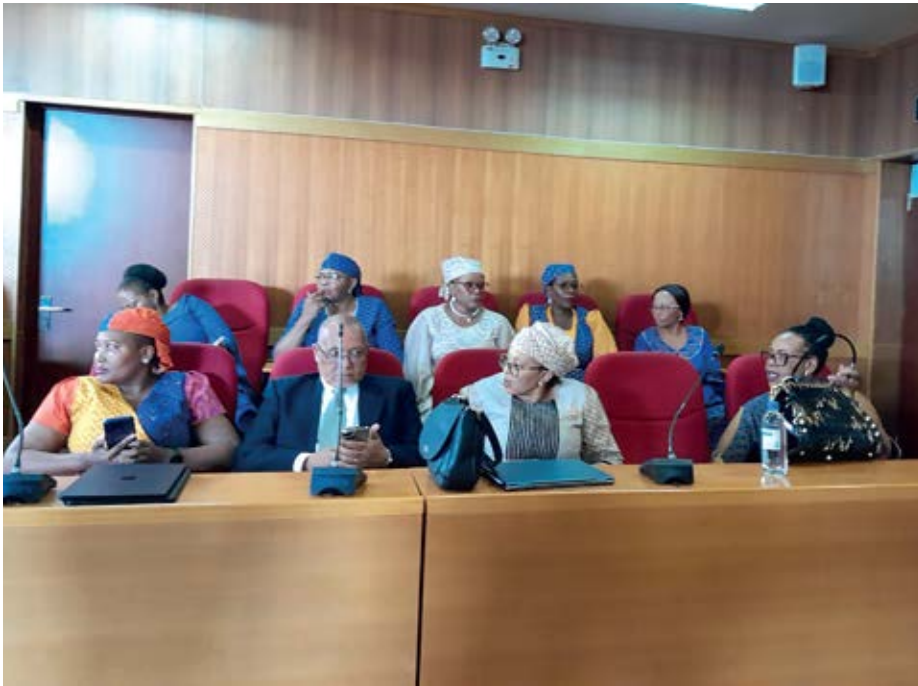
Gvernemnt Ministers and Members of the Women's caucus at the press conference where the Prime Minister was called to declare state of emergency in response to GBV in the country.

The Parliament Women's Caucus has called on Prime Minister Ntsokoane Matekane to declare a state of emergency in response to the alarming rise in gender-based violence (GBV), including the brutal killings of women and children and incidents of rape.