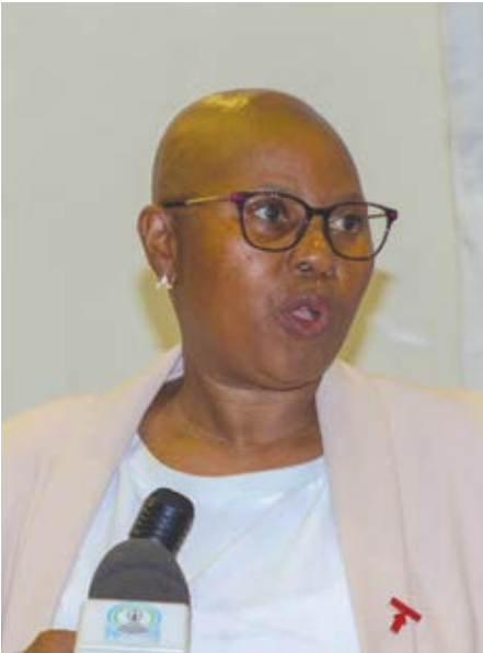
Principal Secretary for Ministry of Health ‘Maneo Ntene during a press conference to commemorate World TB day

TB treatment. Lesotho’s TB Burden and Challenges. Lesotho remains among the world’s 30 high-burden TB countries, with an alarming incidence rate of 664 cases per 100,000 people. Ministry of Health Principal Secretary (PS) ‘Maneo Ntene noted that Lesotho’s TB treatment success rates currently stand at 80 percent for drug-sensitive TB and 74 percent for drug-resistant TB, both below the 90 percent target set by the World Health Organisation (WHO). “The country’s TB detection rate is dangerously low, at only 42 percent, meaning 58 percent of cases remain undiagnosed and untreated, continuing to spread the disease. On average, a TB patient visits healthcare facilities at least three times before receiving a proper diagnosis. This delay, combined with health-seeking behaviour challenges, contributes to a 13 percent fatality rate and an additional 4 percent loss to follow-up cases,” she said. TB continues to disproportionately affect men (68 percent), women (38 percent), and children (4 percent). Key vulnerable populations include people living with HIV, ex-min-