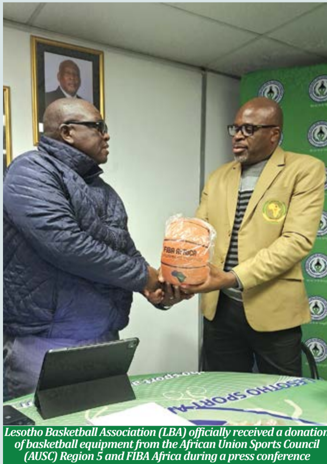
Lesotho Basketball Association (LBA) officially received a donation of basketball equipment from the African Union Sports Council (AUSC) Region 5 and FIBA Africa during a press conference

The Minister highlighted sport's role in