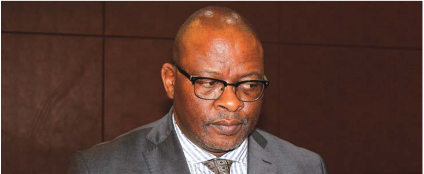
Minister of Foreign Affairs and International Relations Limpho Tau

ically elected government came to power in 1994. Instead, he said, Basotho were busy "chasing each other on useless politics."