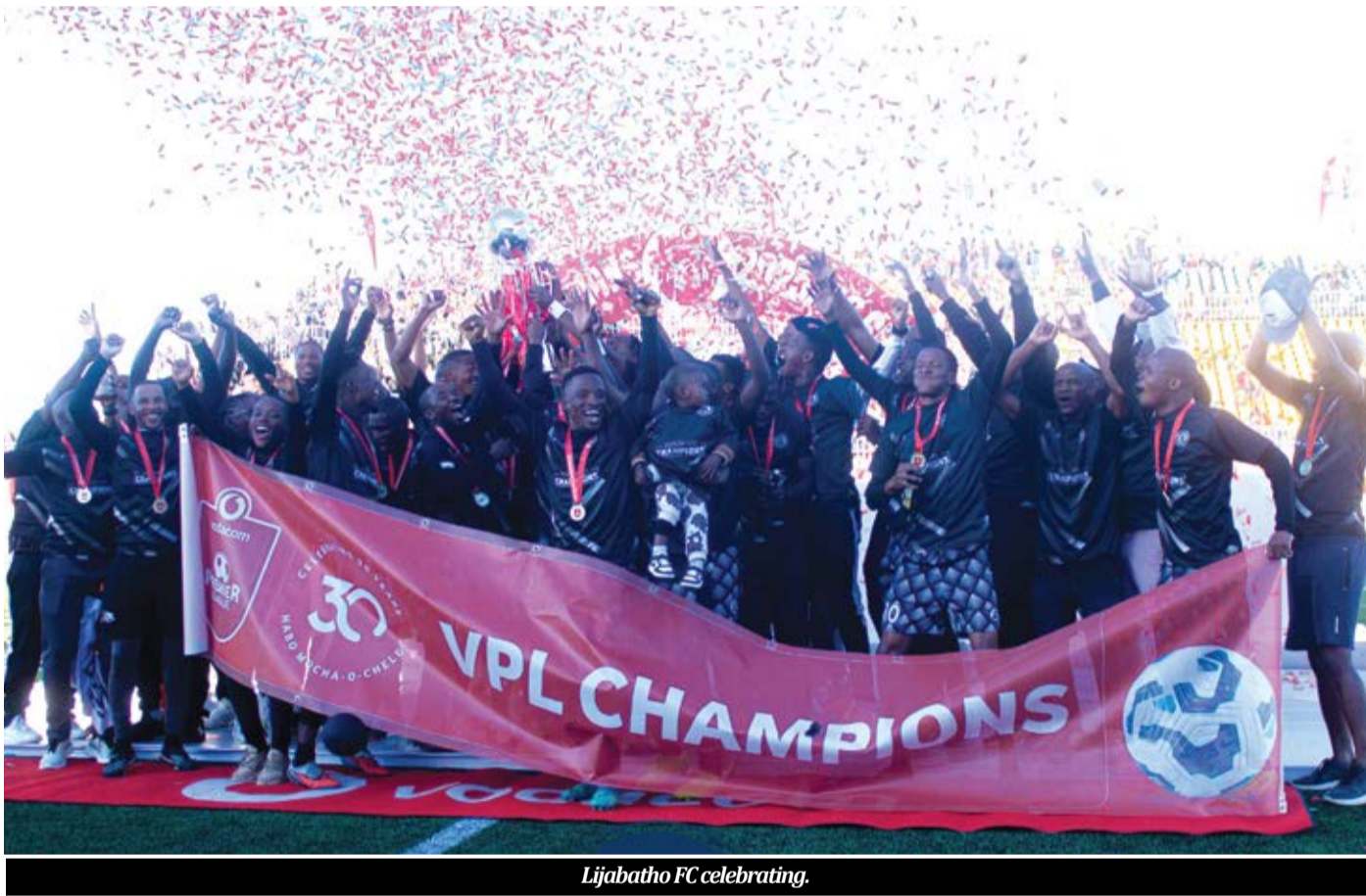
Lijabatho FC celebrating.