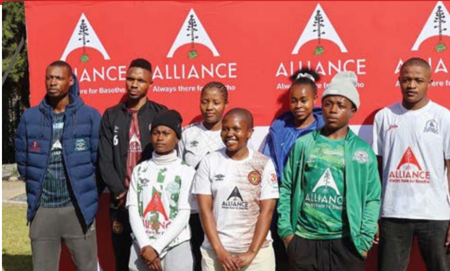
Alliance Challenge 2026 launch at Alliance Garden in Maseru

She said the growth of the competition reflects Alliance Insurance's continued commitment to football development in Lesotho.